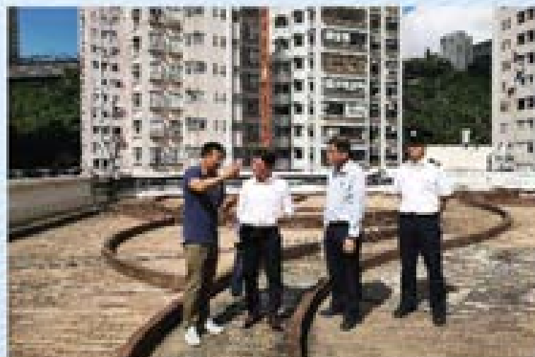
建議綠化市政大廈天台 Suggestion on Greening of Municipal Bldg Roof