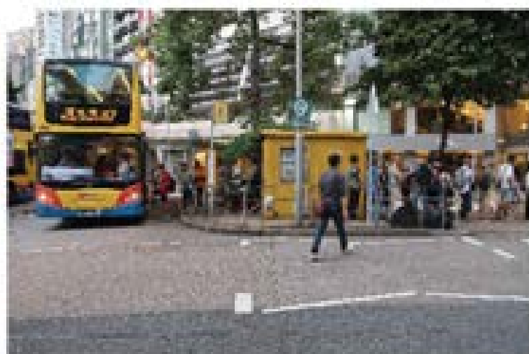
建議增強117繁忙時間班次 To Strengthen 117 Bus services During Rush Hour