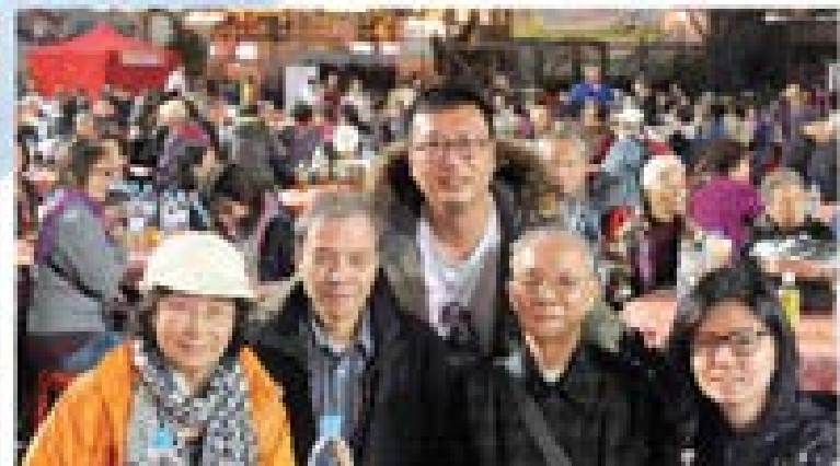
與街坊參加“溫馨家庭盆菜宴” Family Poon Choi Feast