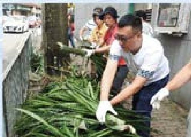
颱風山竹過後 清理倒下樹木 Tidy Up After Typhoon Mangkhut