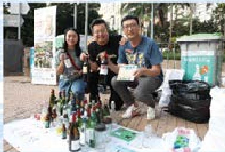
推廣環保，玻璃瓶回收 Glass Bottle Recycling