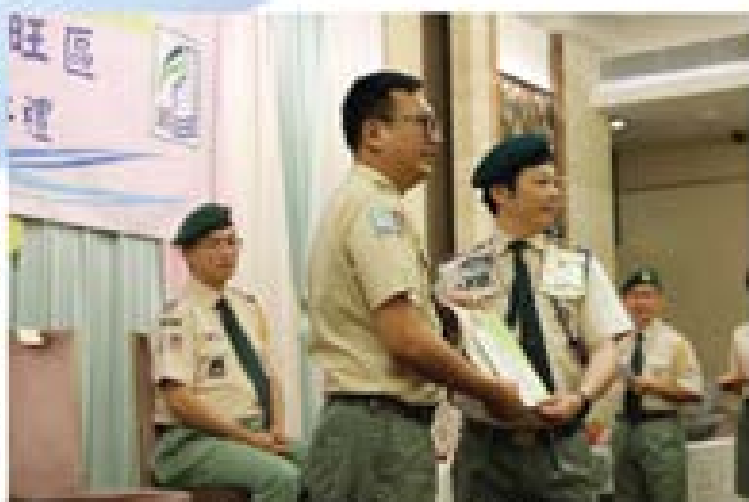
頒發獎狀予優秀童軍 Hand out Certificate of Appreciation to Scouts