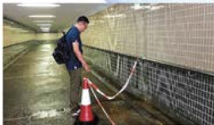
反映及解決往馬場的行人通道滲水問題 Report the Water Seepage Problem in the Tunnel to Racecourse at Wong Nai Chung Garden (Resolved)