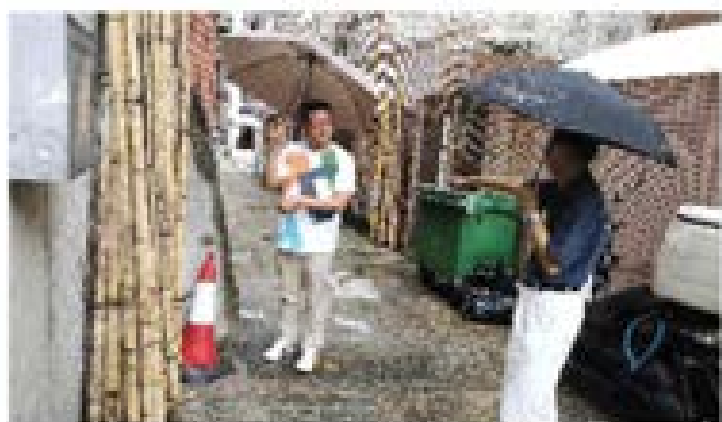
建議桂成里後巷加設路燈 Suggest to install Road Lamp at Kwai Sing Lane back alley