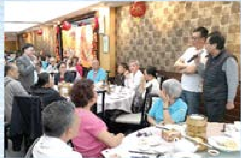
組織業主立案法團與民政署官員討論大廈管理問題 IOs gathering with HAD Staff