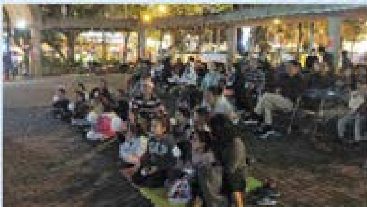
新月公園電影晚會 Outdoor Movie Night