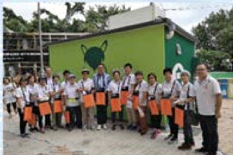
為慈善團體賣旗籌款 Tung Wah Flagday