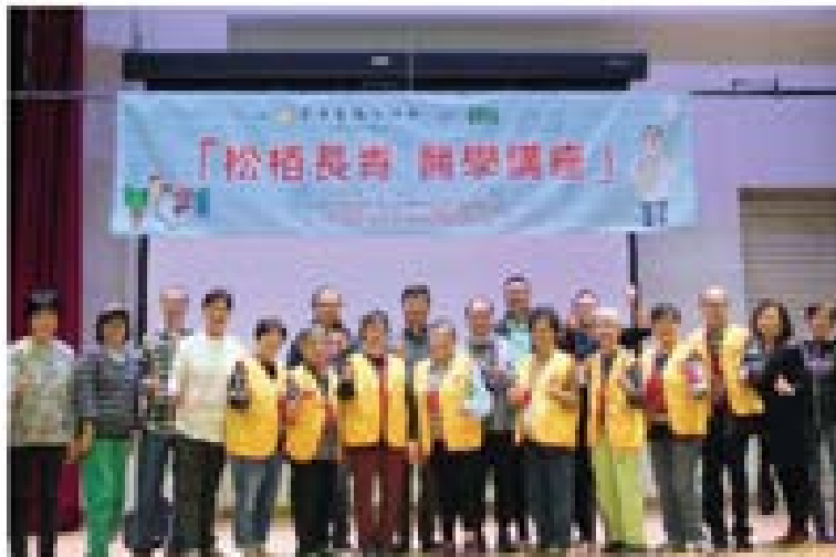
醫學講座 Urology Medical Seminar