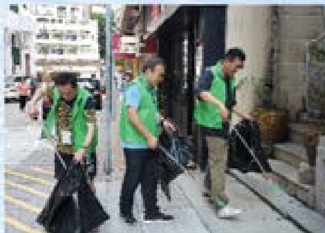
與義工清潔街道 Clean up streets with Volunteers

在區內開展全民清潔運動，呼籲區內市民，保持社區環境清潔，不亂拋垃圾，垃圾放在垃圾桶內，帶寵物上街糞便需要自行收拾。