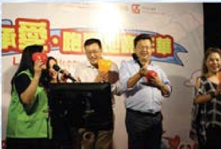
跑馬地嘉年華 LOVE Happy Valley Carnival