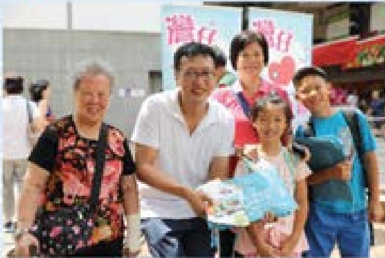
推廣健康飲食習慣 Promote Healthy Eating Habit