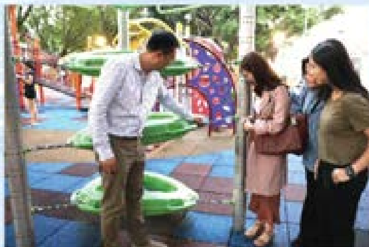
兒童遊樂場設施必須安全第一 Safety First - Children's Playground Facilities