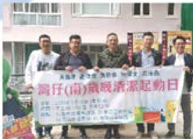
呼籲歲晚清潔 Promote Year-End Cleanliness