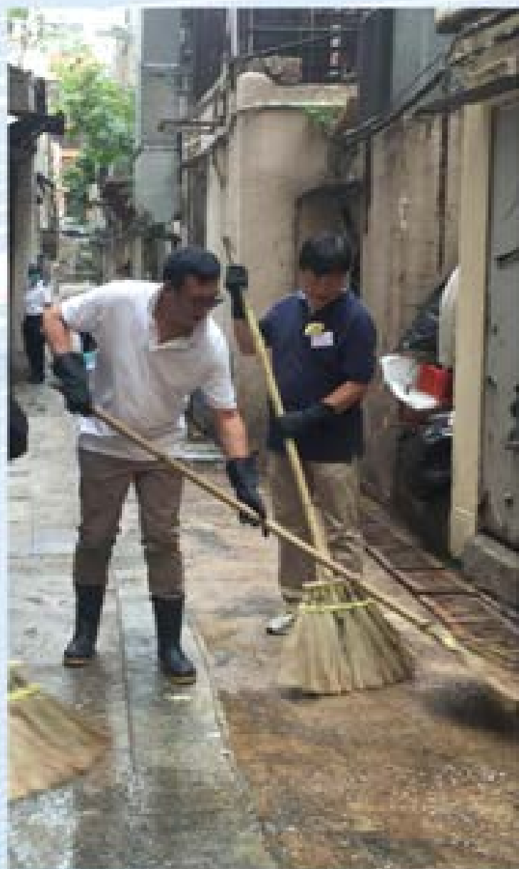
後巷清潔 Cleaning Up Alley