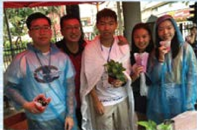
植物領養活動 - 推廣愛護植物、綠化及環保 Promote a Green Environment