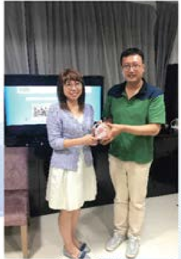
親子皮紋講座 Dermatoglyphics Workshop