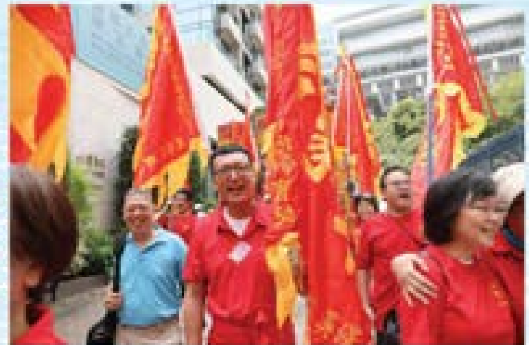
百年歷史 文化傳承 - 熱心參與一年一度的賀區巡遊 Once per Year Tam Kung Festival - being listed as Intangible Cultural Heritage