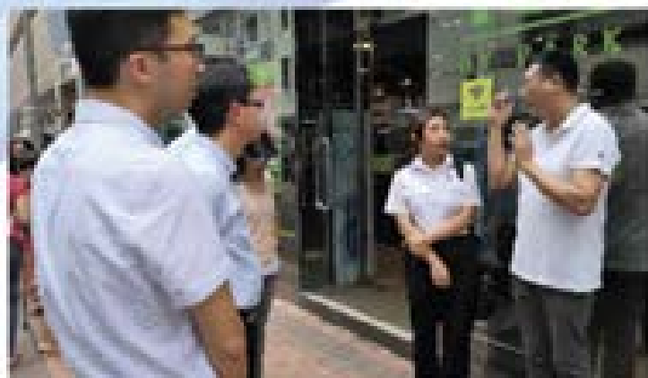
與食環署檢討區內衛生及滅鼠進度 Community Hygiene and Anti-Rodent Progress Discussion