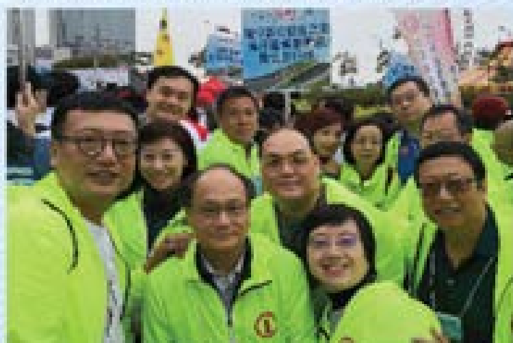
參加公益金百萬行 Participate in Walk for Millions