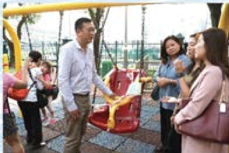
與康文署官員相討新月公園兒童設施保養和維修 Brainstorm with LCSD staff to reduce repair time for Children's Playground Facilities