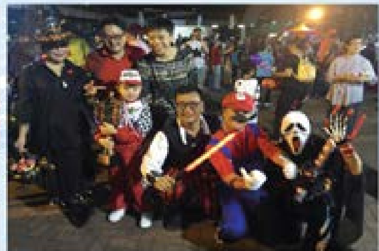
與眾同樂萬聖節2018 Happy Halloween 2018