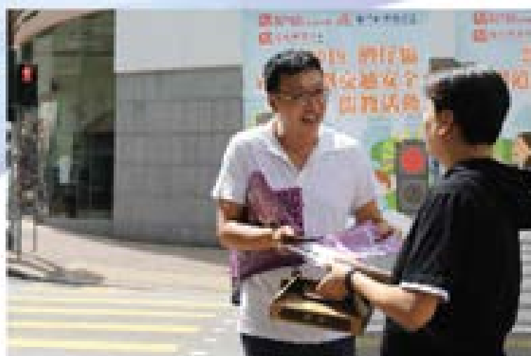
宣揚道路安全 Promote Road Safety

A better solution to lower the occurrence of illegal parking is to increase hourly parking spaces. Toll rationalization to re-distribute traffic flow for the three Harbour Crossings would alleviate the traffic for Happy Valley. Looking forward to the scheme being re-investigated.