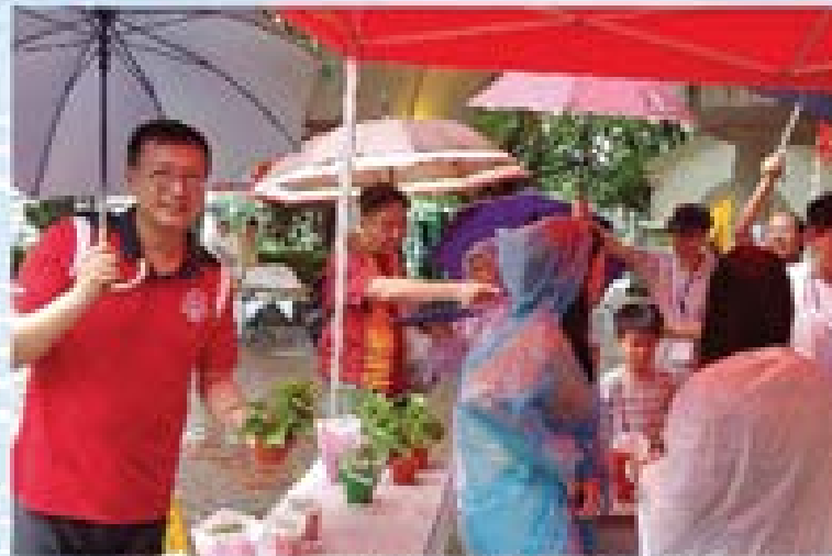
植物領養活動 - 推廣愛護植物、綠化及環保 Free Plant Giveaway Day