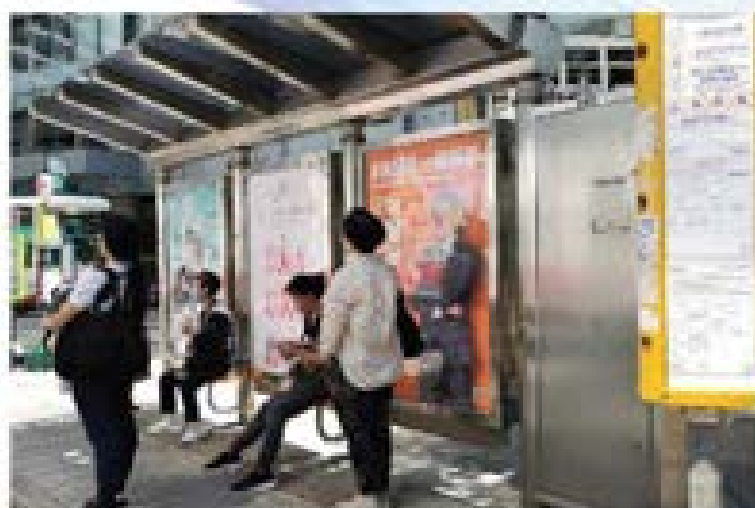
建議更新景光街巴士站設施(參考圖) Suggestion on a New Bus Shelter at King Kwong St