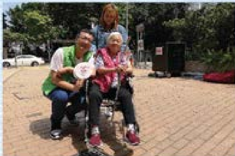
母親節送花予區內母親 Mother's Day