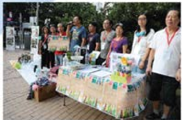
舉辦環保回收活動 Host Recycling Day