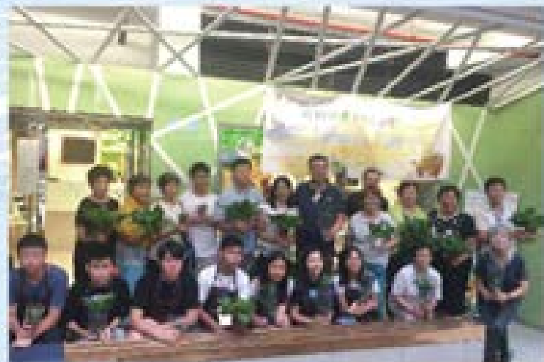
與青少年中心合辦植物領養活動 Free Plant Giveaway Day co-organized with Sing Woo Children and Youth Centre