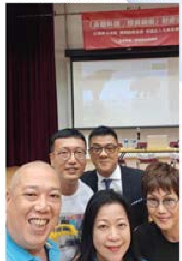
財經講座 Finance Seminar