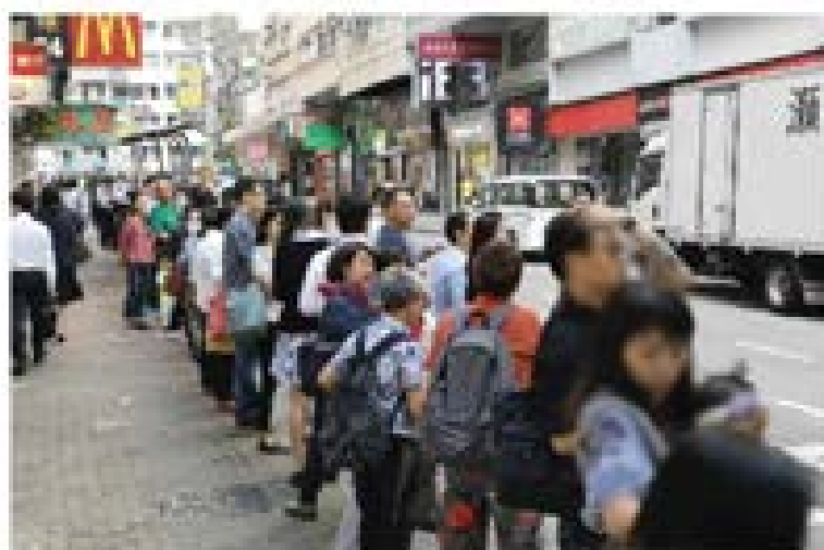
早上繁忙時段候車人數眾多 Long Queue during morning rush hour