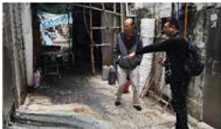
關注後巷污水渠 Inspection of the Broken Sewage Pipe that affects the Neighbourhood