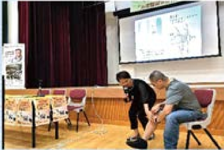
舉辦中醫講座 - 醫師正指導街坊穴位保健 Chinese Medical Workshop re: Knee Cap Care