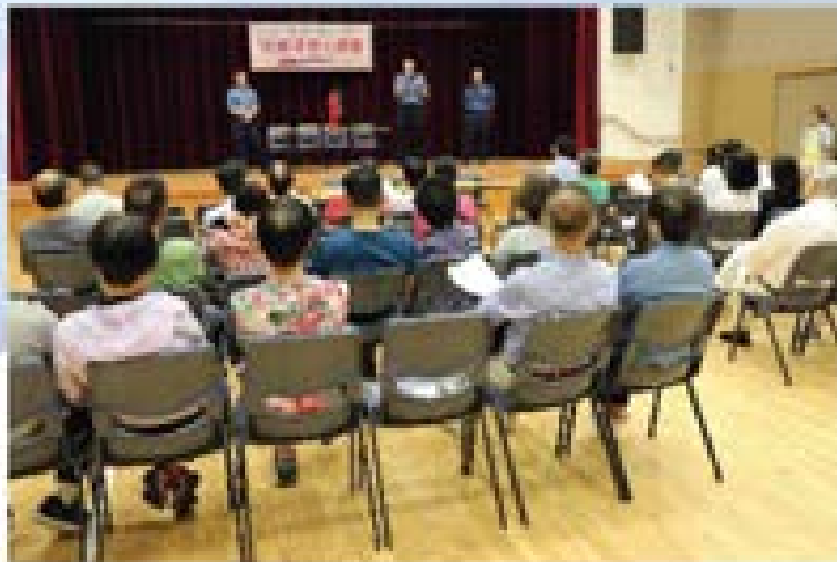
消防講座 業主齊參與 Fire Safety Seminar